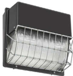
WG - Wire guard