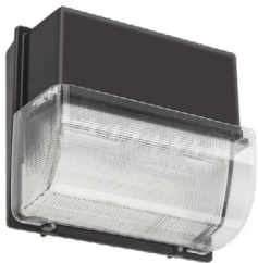
VG - Vandal guard