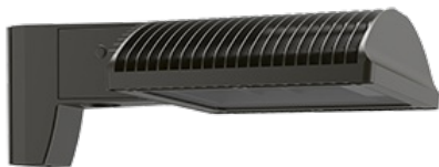
Featured Products: RAB Lighting ALED3T150, ALED4T150

Bay Lighting Services converted HID lamps to LED with no interruption to the daily operation at EconoPark Express.