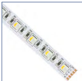
Featured Products: JESCO DL-AC-FLEX, DL-FLEX2-RGBW