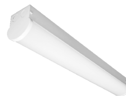
Stairwell Featured Product: Nicor LSC-10-4S-U-40-M

The stairwells were converted from 2-lamp fluorescent T8 fixtures to step-dim LED fixtures that come on one at a time when motion is detected. The sensor has adjustable sensitivity levels, dimming levels, and hold times to suit a variety of needs.